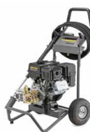
HD6/15G / HD7/20G